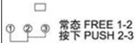
电路图 circuit diagram