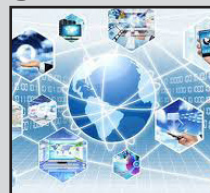
Internet of Things