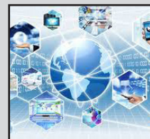
Internet of Things