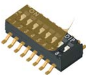
Model No. KSD-DHNF